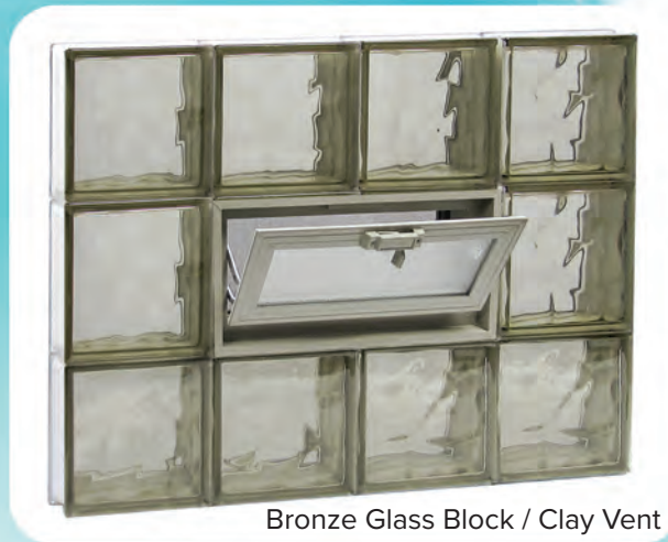
Bronze Glass Block / Clay Vent