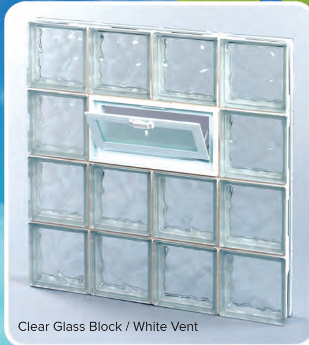
Clear Glass Block / White Vent